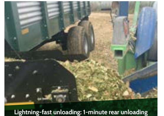
and 4-minute front unloading.